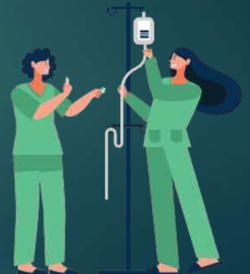
Signature of Guardian